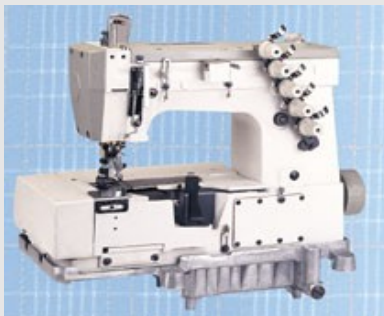
TK-6603F (For binding)

This machine is designed for top and bottom coverstitch sewing with binder and differential feed mechanism, which is extremely suitable for knit materials.