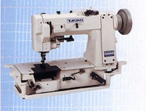
"U" Type Flat Bed