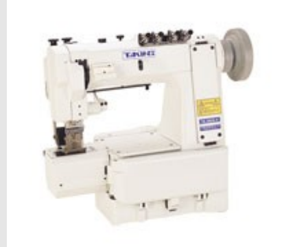
"U" Type Cylinder Bed