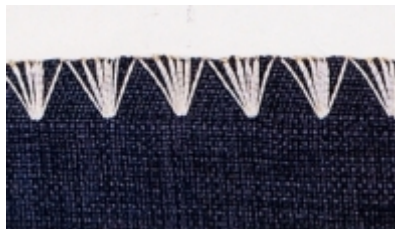
Small-size 3/16" Lockstitch