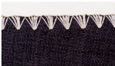
Large-size 1/4" Lockstitch

Feature: Suitable for ready-made garments, hems, (sleeve) cuffs, collars and other fabric embellishment. Advantage: The needle does not destroy the texture of the cloth.