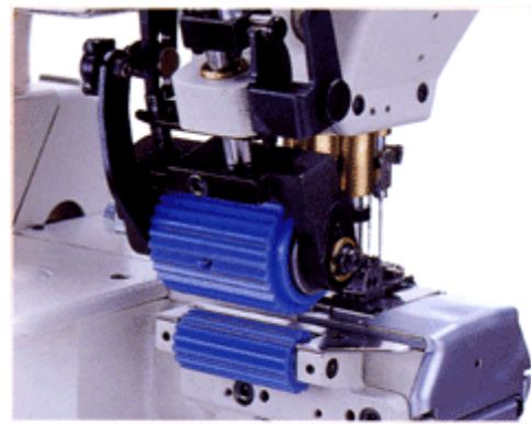
精密設計拖輪組。 It is exact design the roller device.