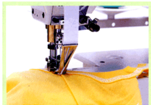
適用各式壓條和雙鏈縫。 Able to apply various double chainstitches and tape binding stay.