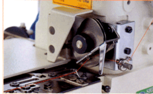
專利設計全新改良，可調換之底線供給機構不易絞線，降低故障率。 It's newly patented design for an adjusted the feeder structure of the lower ornament looper thread take up for prevented winding thread and to lower the percentage of the breakdown.