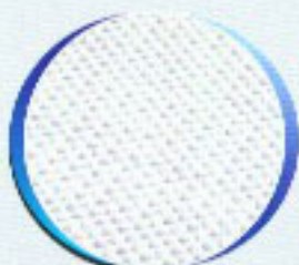
零反射铁质工作底板 No-reflection metal honeycomb work table