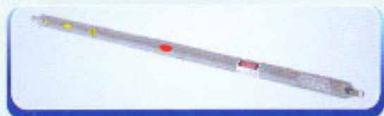
采用国内品质保证的CO 2 激光器 High quality domestic CO 2 Laser tube

This model is specially designed for bulk production such as appliques cutting, leather and PU cutting and engraving for garment and shoes industries. Equipped with two laser tubes, this model of laser cutting and engraving machine can double the production output as well as ensuring fine quality.