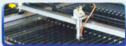
高精度直线导轨 High-precision straight linear guide

This model is professionally designed for organic glass (acrylic) processing industry. Beyond Laser adopts high producing technology on this machine, such as originally Taiwan imported precise guide and Italy imported belt, to ensure high working speed, fine cutting and engraving effect and precise locating.