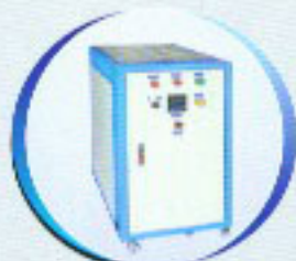
可靠的散热冷却设计，专业制冷水机 Professional refrigeration water chiller