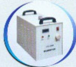
专业制冷水箱 Professional refrigeration water chiller