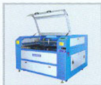
HS-Z7050/1280/1290/1490/1410 型 有机工艺激光切割/雕刻机

HS-T1080/1280 High-speed Laser Cutting/Engraving Machine