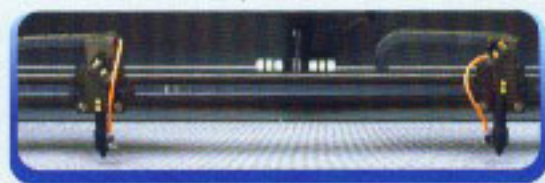
高效率双激光头设计 Highly-efficient double-head design