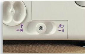
Built-in upper knife clutch device