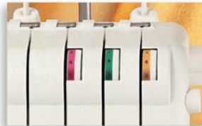
Built-in tension adjusting device