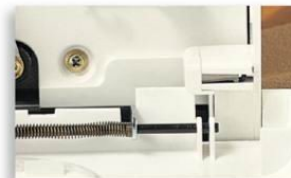
Safety switch : To prevent any danger while looper cover is opened