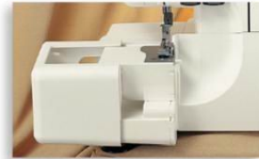
Free arm : Detachable extension plate for free arm sewing