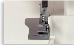
Built-in rolled hem : No need to change the needle plate