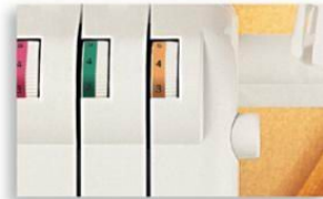
Tension release : To ensure all 3 threads can be inserted in the discs. You can also remove the finished work piece without the interruption on tensions.