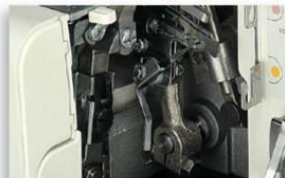
Auto looper threader