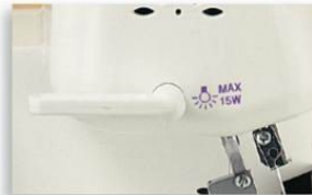
Built-in sewing lamp