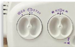
Differential and stitch length knobs