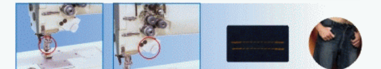
Auto thread-take Manual backstitch sewing device